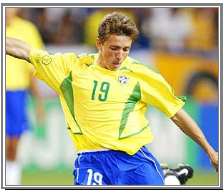
Juninho Paulista in action for Brazil

"It would be great to be able to play with someone like him."