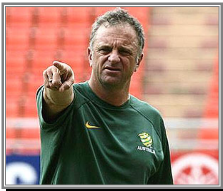
Socceroos Coach Graham Arnold

FFA chairman Frank Lowy, who worked so tirelessly to make the Asian Football Confederation accept Australia in to Asia's football family, is understood to be greatly disturbed by the incident.