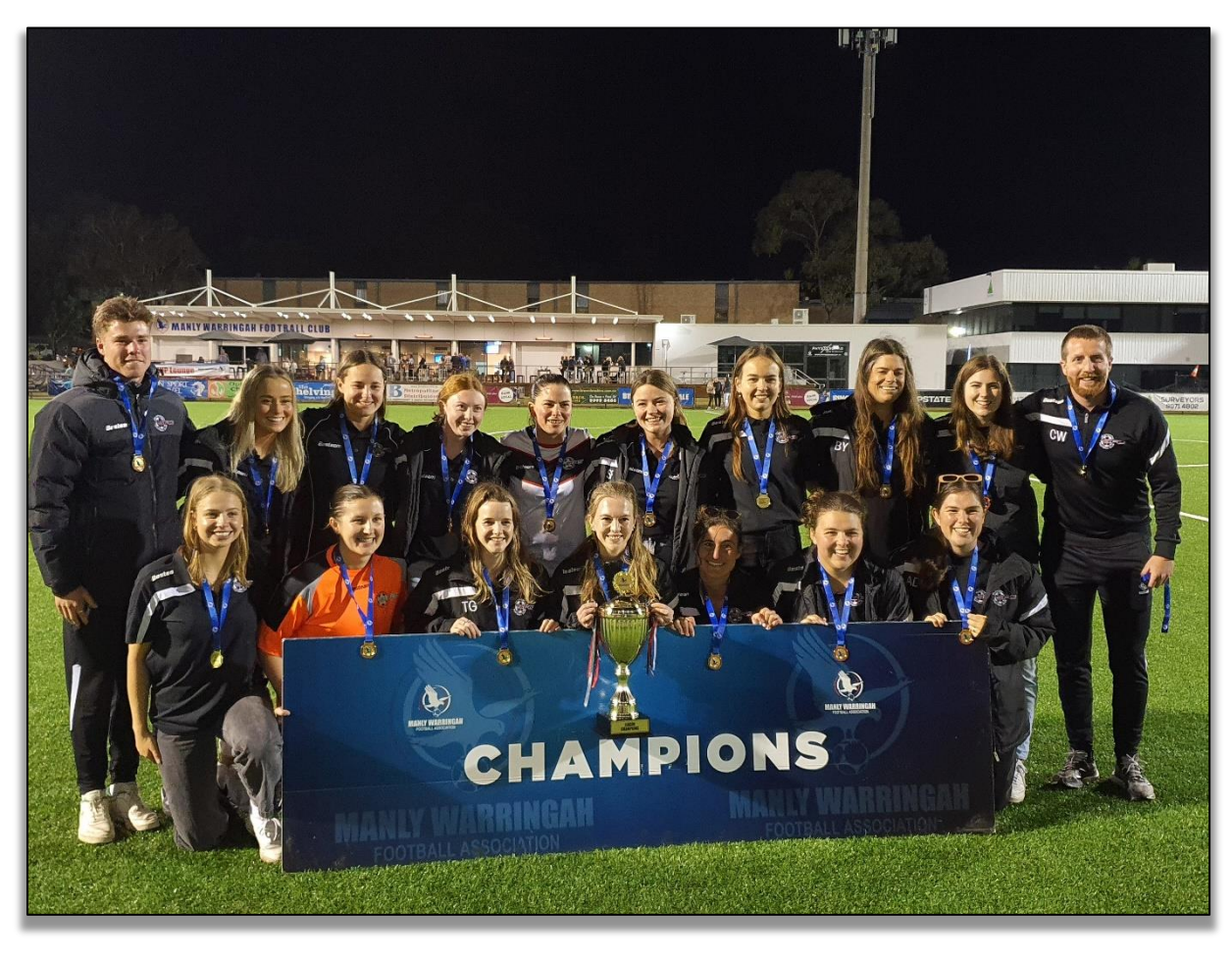
Our WPL Reserve team with their league winner's trophy