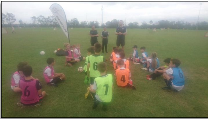
Grading day at the Oval