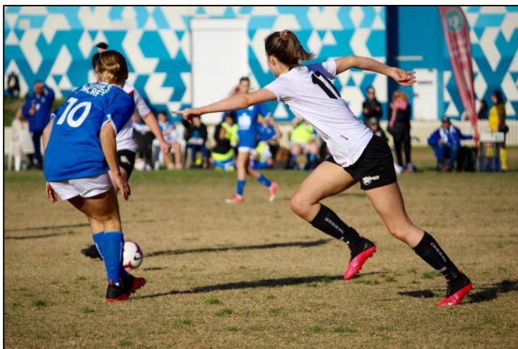
Local derby .. vs Brookvale