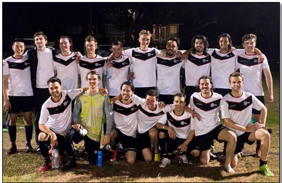
The AL6s .. pretty happy after winning their grand final