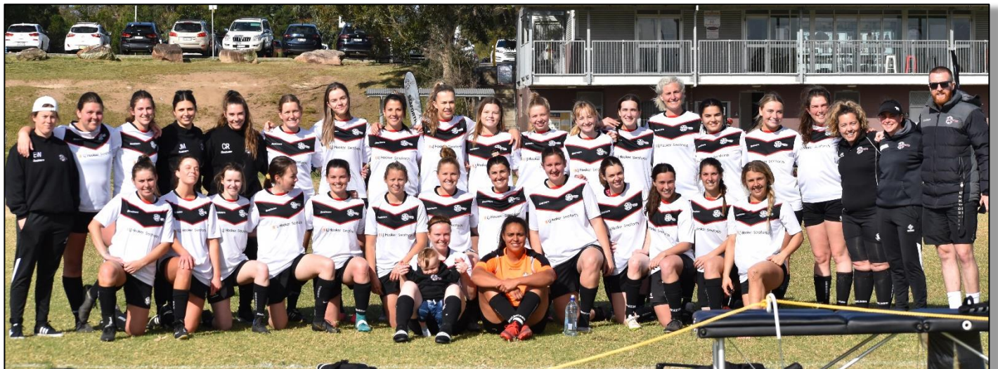
The 2020 Women's Premier League squad