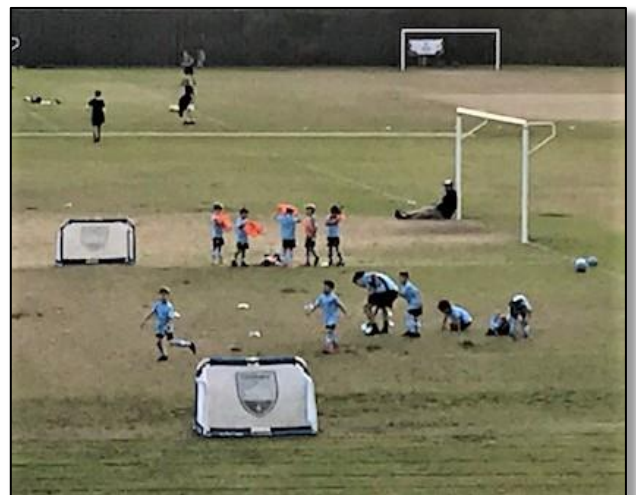
Our juniors enjoying the Sydney FC Skill Development Program at the Oval