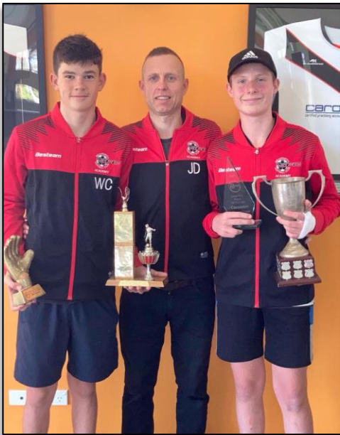
Our 14/1 Boys shine taking out Junior Boy Player of the Year & Best Junior Keeper