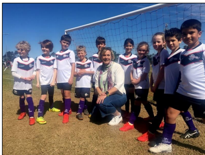
Local MP Zali Steggall (and long-time Seaforth FC member) with some of our fine young Purple Socks ambassadors

Once again Seaforth FC was a solid supporter of the Purple Socks for Pancreatic Cancer campaign run by the Avner Pancreatic Cancer Foundation. Well done to everyone who was part of that.