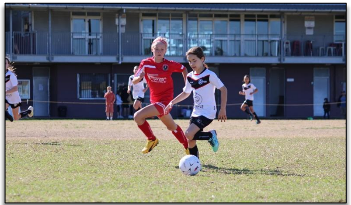
Our W12 girls Academy team on an attacking raid