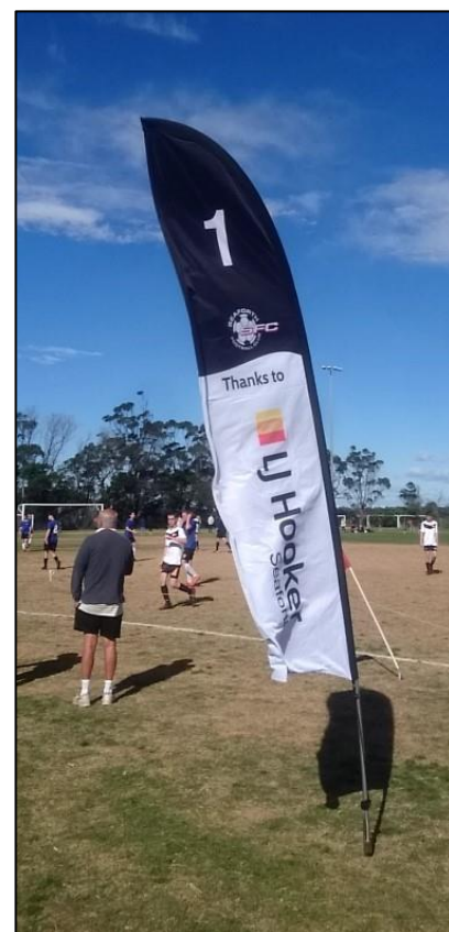
New field banners acquired in (late) 2020 - making it easier to find your pitch