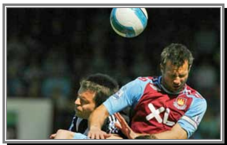
West Ham captain Lucas Neill vies for the ball with fellow Socceroo Mark Viduka

Socceros and West Ham defender Neill had been strongly linked with a move to the Turkish giants, but a move to the 2007/2008 Turkish Super Liga Champions now looks unlikely.