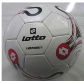
Football (Lotto Campione) - $20