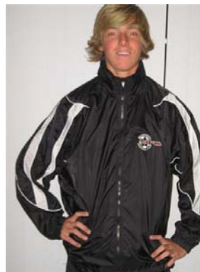
Club Jacket (white stripe) - $60