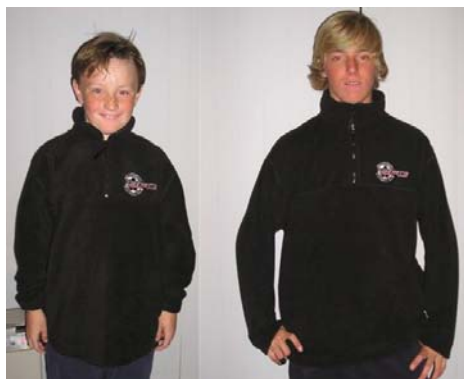
Tracksuit Top (polar fleece) - $40 kids $45 Adult